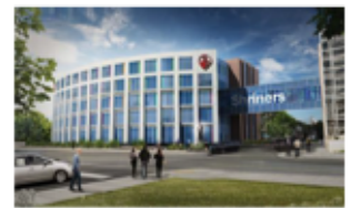
Lexington, KY ● 859-266-2101