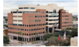
Galveston, TX ● 409-770-6600