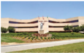
Greenville, SC ● 864-271-3444