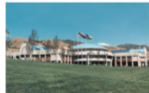
Salt Lake City, UT ● 801-536-3500