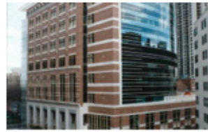
Boston, MA ●●● 617-722-3000

Shriners Hospitals for Children® is changing lives every day through innovative pediatric specialty care, world-class research and outstanding medical education. Our 22 locations in the United States, Canada and Mexico provide advanced care for children with orthopaedic conditions, burns, spinal cord injuries, and cleft lip and palate, regardless of the families' ability to pay.