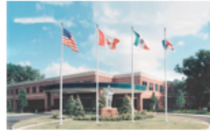
Erie, PA ● 814-875-8700