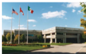
Springfield, MA ●●● 413-787-2000