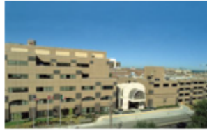
Cincinnati, OH ●●● 800-875-8580