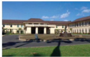
Honolulu, HI ● 808-941-4466