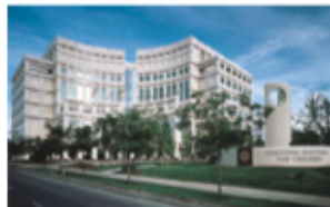
Sacramento, CA ●●●● 916-453-2000