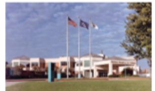
Shreveport, LA ●●● 318-222-5704