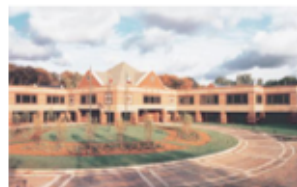
Minneapolis, MN ● 612-596-6100