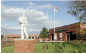
Chicago, IL ●●● 773-622-5400