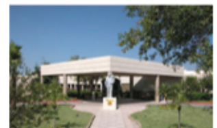
Tampa, FL ● 813-972-2250