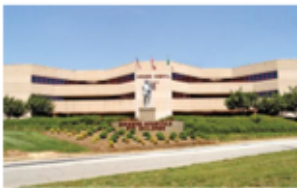
Greenville, SC ● 864-271-3444