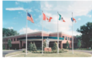
Erie, PA ● 814-875-8700