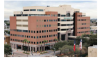
Galveston, TX ● 409-770-6600