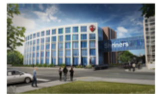
Lexington, KY ● 859-266-2101