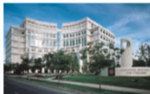
Sacramento, CA ●●●● 916-453-2000