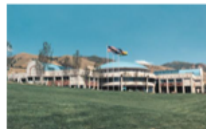
Salt Lake City, UT ● 801-536-3500