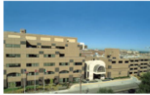
Cincinnati, OH ●●● 800-875-8580