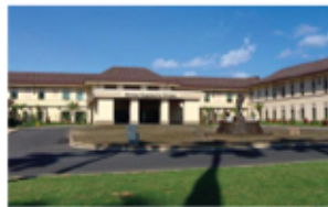
Honolulu, HI ● 808-941-4466