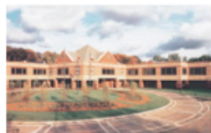
Minneapolis, MN ● 612-596-6100