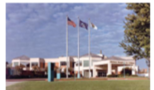
Shreveport, LA ●●● 318-222-5704