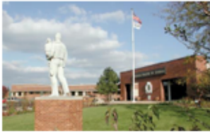
Chicago, IL ●●● 773-622-5400