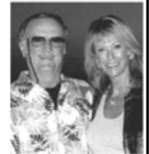
35 years in the same location

ROLEX - Sales & Service Diamond Watch Accessories