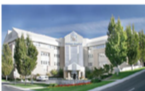
Spokane, WA ● 509-455-7844