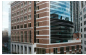
Boston, MA ●●● 617-722-3000

Shriners Hospitals for Children® is changing lives every day through innovative pediatric specialty care, world-class research and outstanding medical education. Our 22 locations in the United States, Canada and Mexico provide advanced care for children with orthopaedic conditions, burns, spinal cord injuries, and cleft lip and palate, regardless of the families' ability to pay.