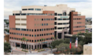
Galveston, TX ● 409-770-6600