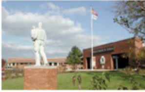
Chicago, IL ●●● 773-622-5400