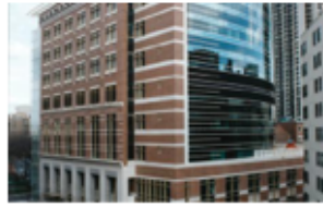
Boston, MA ●●● 617-722-3000

Shriners Hospitals for Children® is changing lives every day through innovative pediatric specialty care, world-class research and outstanding medical education. Our 22 locations in the United States, Canada and Mexico provide advanced care for children with orthopaedic conditions, burns, spinal cord injuries, and cleft lip and palate, regardless of the families' ability to pay.