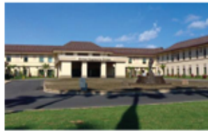
Honolulu, HI ● 808-941-4466