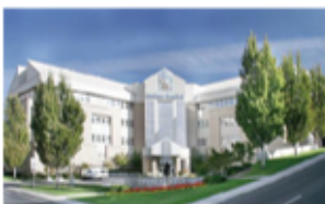
Spokane, WA ● 509-455-7844