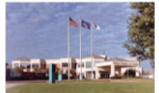
Shreveport, LA ●●● 318-222-5704