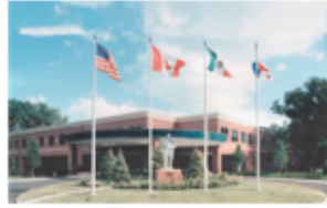
Erie, PA ● 814-875-8700