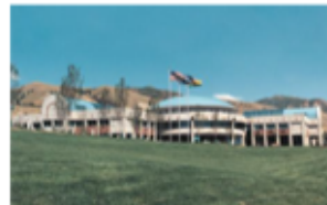
Salt Lake City, UT ● 801-536-3500