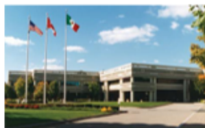
Springfield, MA ●●● 413-787-2000