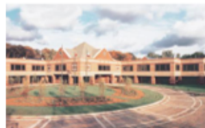
Minneapolis, MN ● 612-596-6100