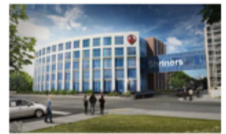
Lexington, KY ● 859-266-2101