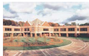
Minneapolis, MN ● 612-596-6100