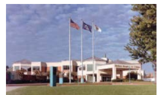
Shreveport, LA ●● 318-222-5704