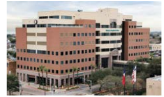
Galveston, TX ● 409-770-6600