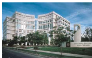
Sacramento, CA ●●●● 916-453-2000