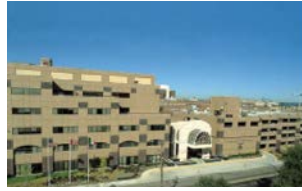
Cincinnati, OH ●●● 800-875-8580