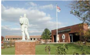
Chicago, IL ●●● 773-622-5400